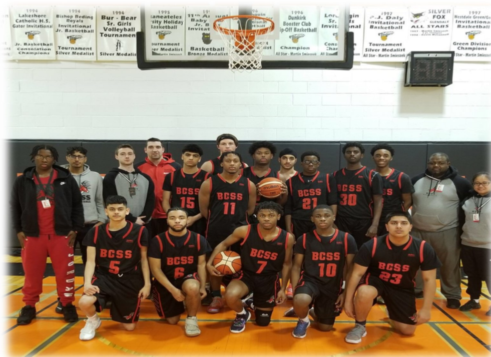
Brampton Centennial Senior Boys Basketball Team