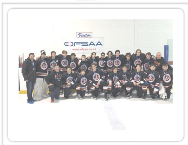
Iona A/AA Boys Team