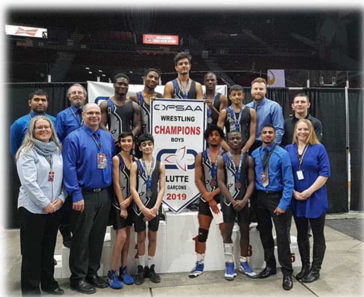
Turner Fenton Boys Team