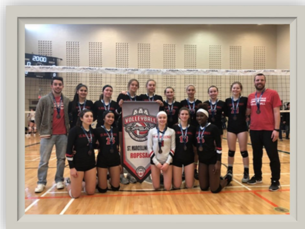
St. Marcellinus Girls Volleyball Team