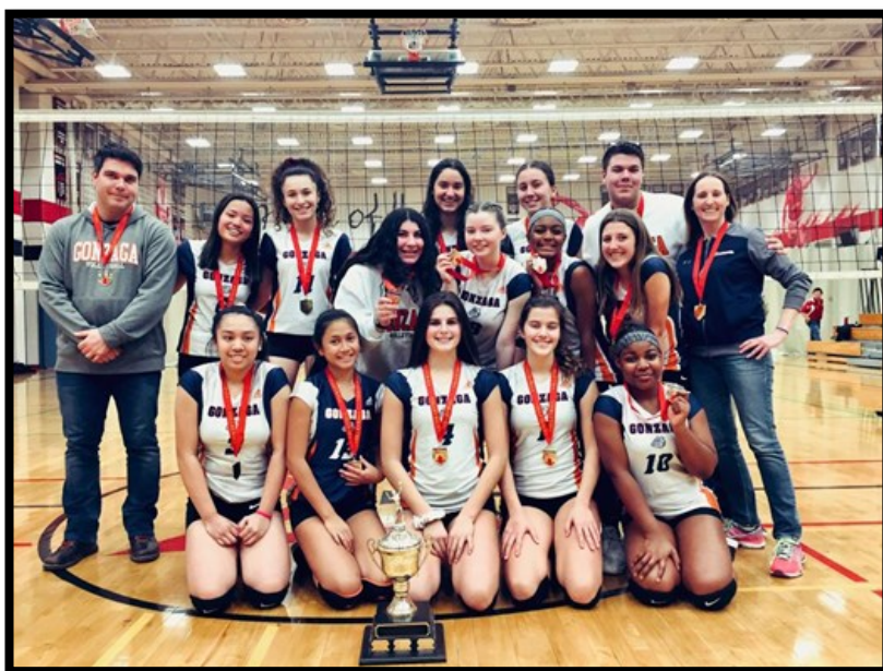
St. Aloysius Gonzaga Jr Girls Volleyball team