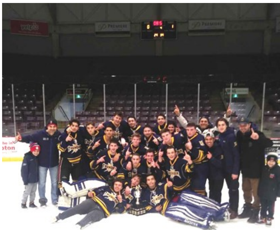
St. Michaels Varsity Boys Hockey team