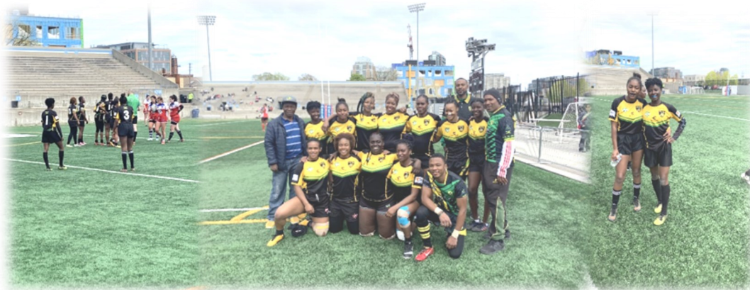
The Jamaican Rugby league team