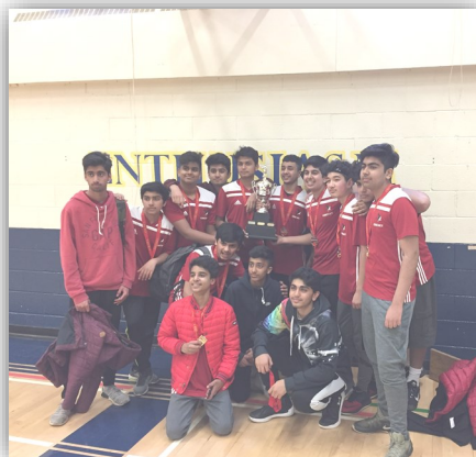
Stephen Lewis Junior Cricket Team