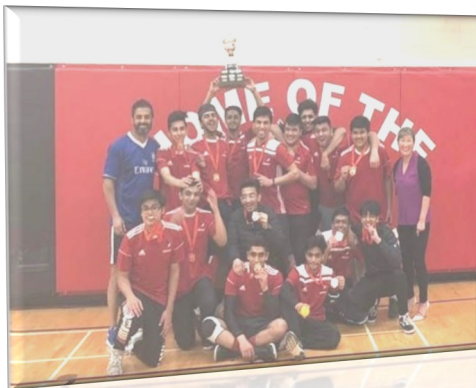
Stephen Lewis Senior Cricket Team

Stephen Lewis had a great 2018-2019 cricket season. Both the Junior Boys Cricket Team and the Senior Boys Cricket Team reached ROPSSAA Finals, and went on to become ROPSSAA Champions. Worth mentioning is that the Senior Team went undefeated the whole season and that the Junior Team is the first junior SLSS team to win ROPSSAA gold!