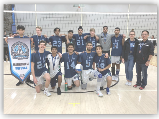
Antique Bronze Winners