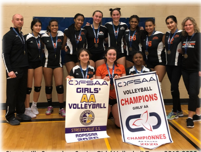
Streetsville Secondary Senior Girls' Volleyball Team 2019-2020