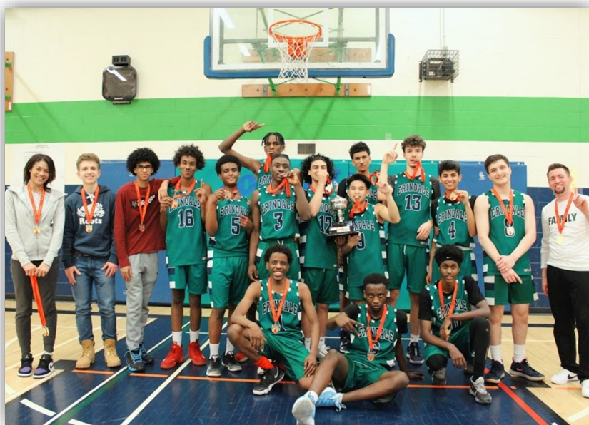
Erindale Senior Boys Basketball Team