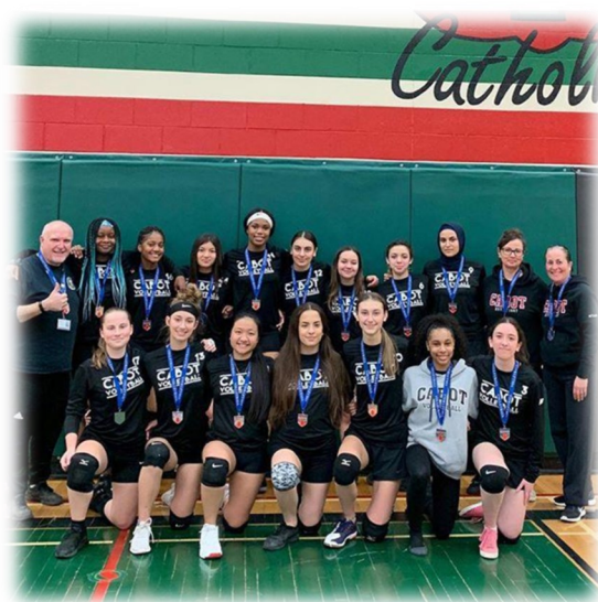
John Cabot Girls' Volleyball Team 2020