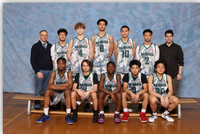
St. Paul Boys Basketball 2019-2020

The St. Paul Senior Boys Basketball team had its most successful season in school history. The team compiled an overall record of 29 wins and 4 losses. The record included an undefeated regular season and its first ever Boys ROPSSAA A Championship. In November, the Wolverines became tournament champions of the Seneca College invitational. The team also made semi final appearances in both the University of Western and All Catholic tournaments. St. Paul concluded its season participating in the OFSAA A Basketball Championships in North Bay. At that tournament, the team went on to win a silver medal.