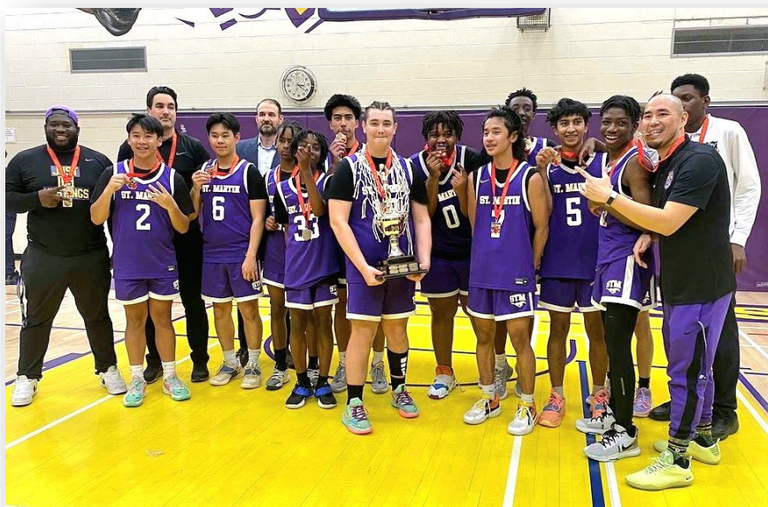
2021-2022 Junior Boys ROPSSAA Champions