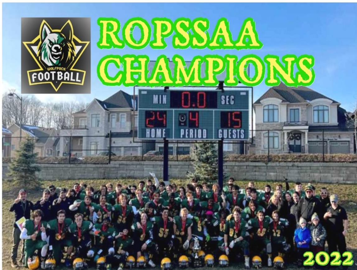
Robert F. Hall Football Team

Hi there - here is a picture of the Varsity Boys Tier 2 Champions, the Robert F. Hall Wolfpack. This was our first season back after 2 years of Covid, it was a success story from the very beginning. We knew we had something special when 45 players came out for June workouts, all this without any late bus running. 90% of the team never played football before, including the Quarterback, but through dedication and perseverance, they improved every day. The team went undefeated in the regular season, then beat St. Martin's in the Semi-finals. In the finals, which were held at Robert F. Hall C.S.S. for the first time ever, Hall faced off against a vastly improved Humberview Huskies team to accomplish another first - two Caledon teams in the Finals. Hall would prevail 24 - 15 to capture their 4 th ROPSSAA championship in the school's history.