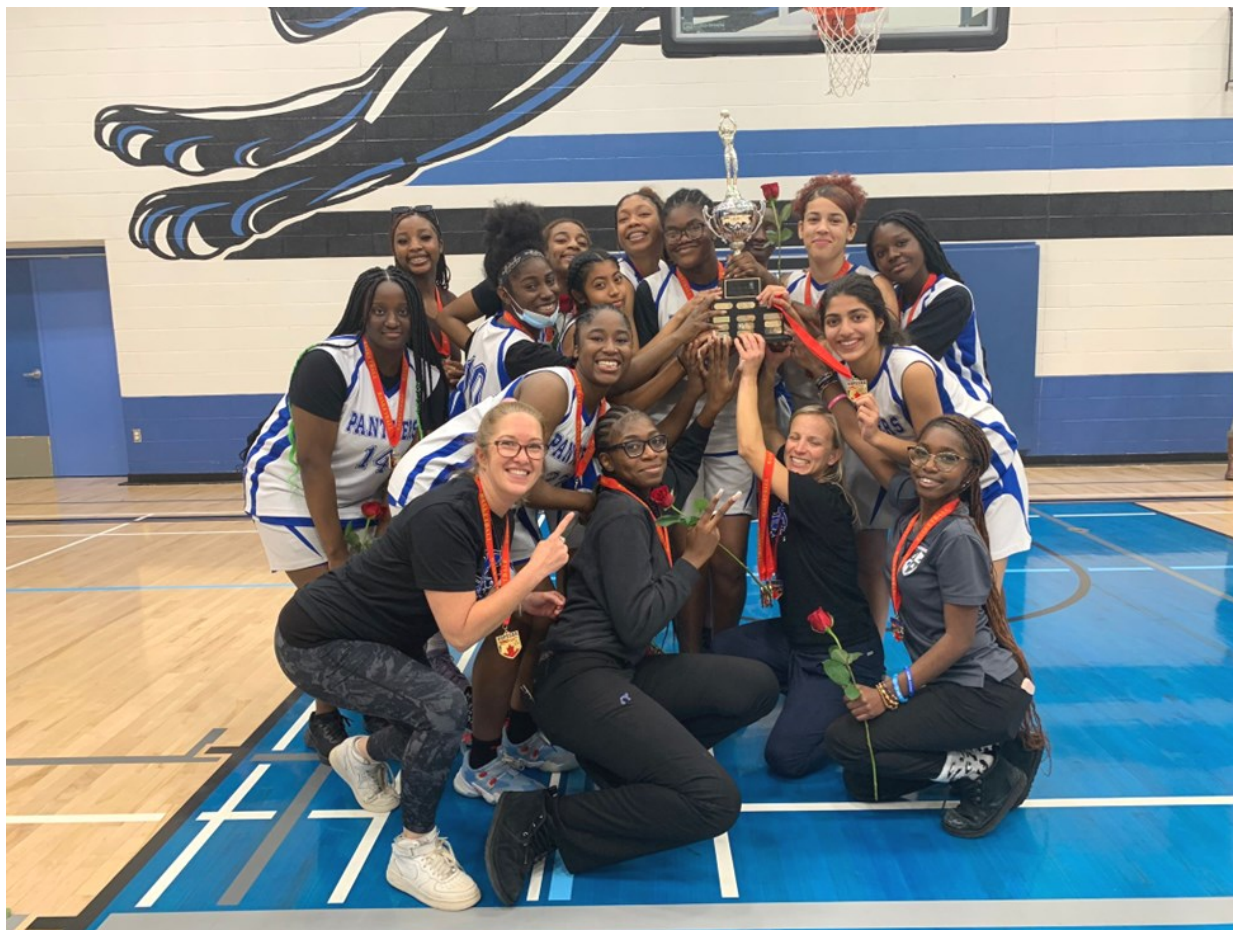
St. Marguerite d'Youville Girls' Basketball Team